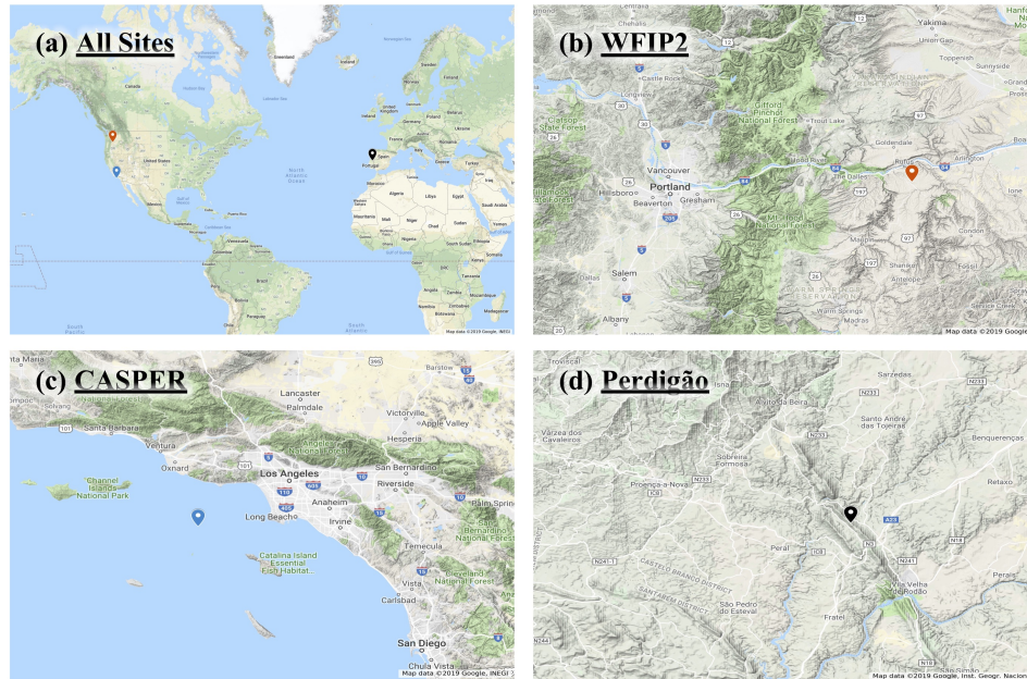
Figure 2. (a) depicts all site locations. Remaining three panels depict topography at (b) WFIP2, (c) CASPER, and (d) Perdigoão.

ridge topography. The ridges are spaced approximately 1.4km apart with a valley in between. Both ridges rise approximately 250m above the surrounding topography, which mainly consists of rolling hills and farmland. Data were taken from a Leosphere profiling lidar, denoted by the black marker in Fig. 2d, which was located on top of the northern ridge of the Perdigoão double-ridge. This particular location was selected due to the multitude of complex flow patterns seen at this location during the campaign. Profiler data available at all heights were used for this study, and any data below 30% availability over 10 minutes were ignored.